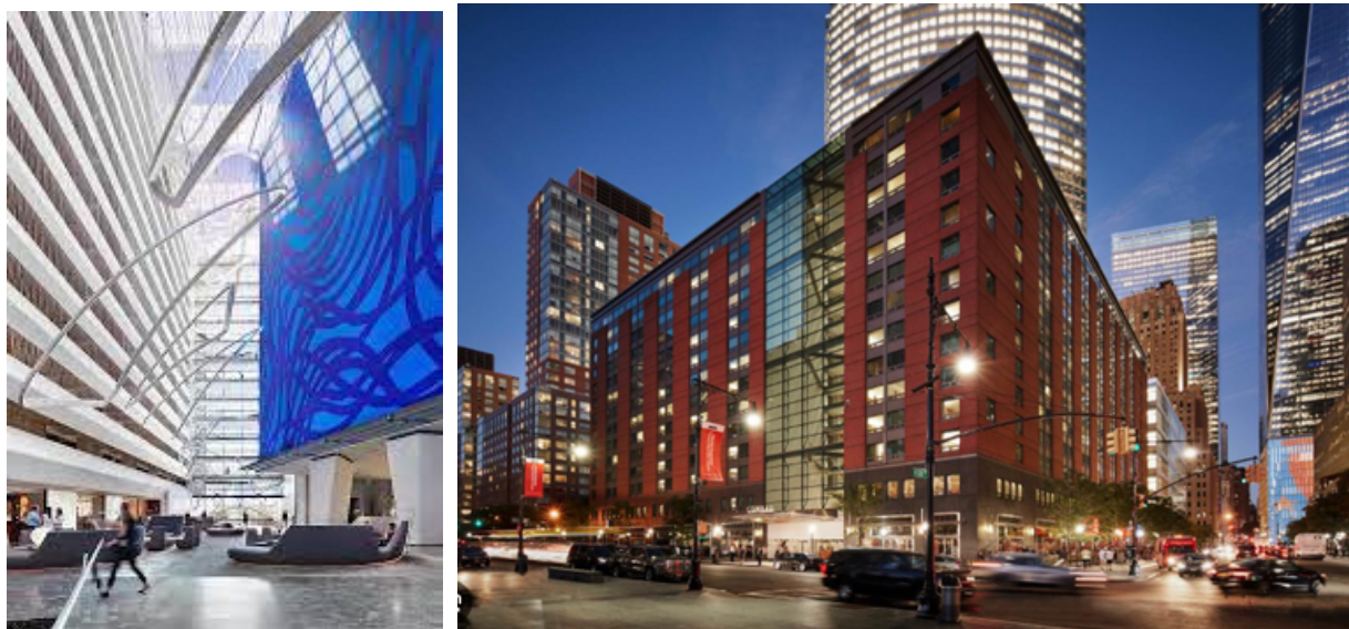
MEETING VENUE: CONRAD NEW YORK DOWNTOWN

ICAS members can benefit from the lowest registration rate: Government/Academia/ICAS - $1,100.00