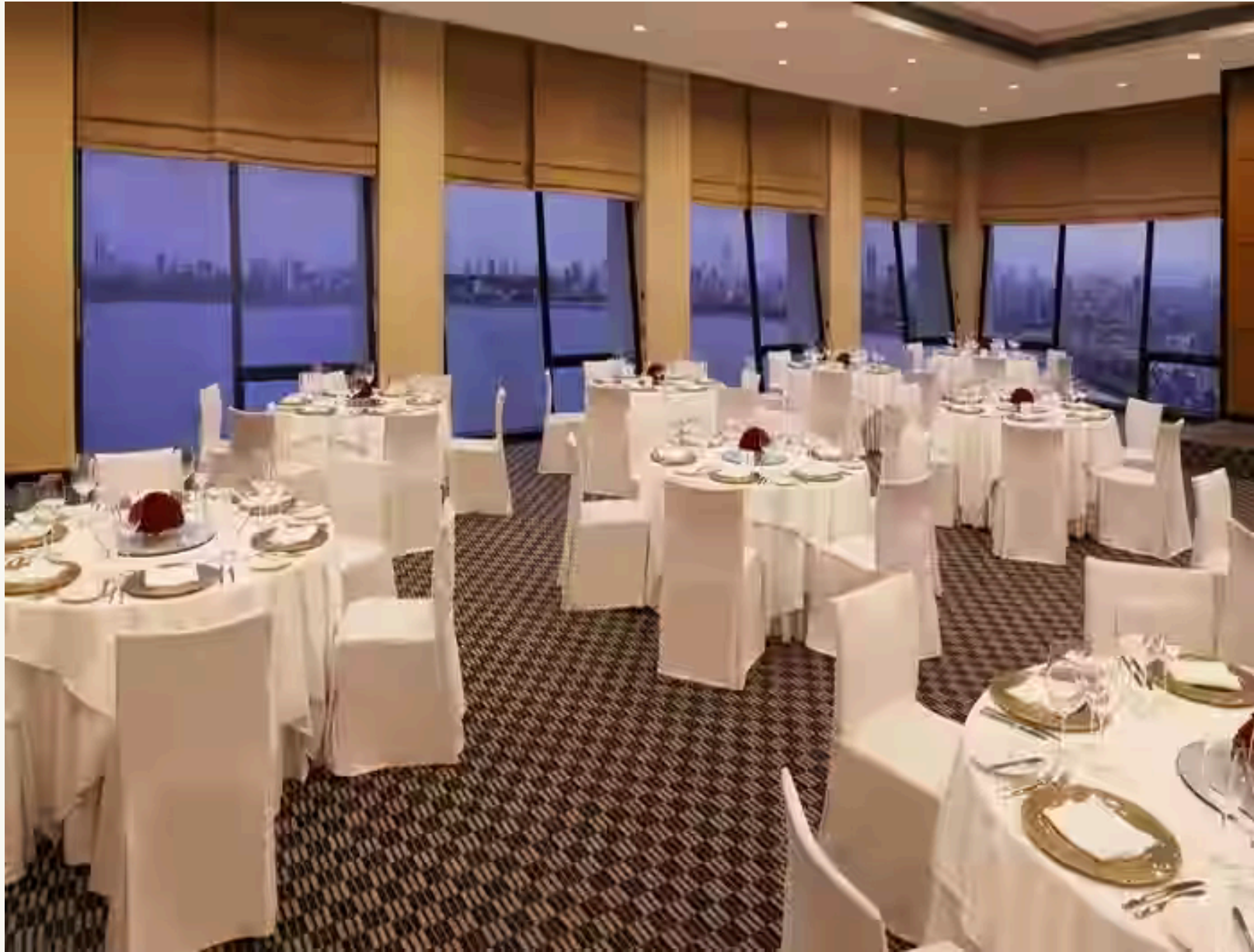
ICAS & Global Think Tank Meetings on 17 and 18 March Trident Rooftop