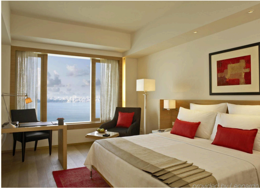
Your Hotel Stay 16 – 21 March (5 nights)

ASCI has managed hotel accommodations and all local arrangements and will cover expenses in Mumbai for ICAS members who registered.