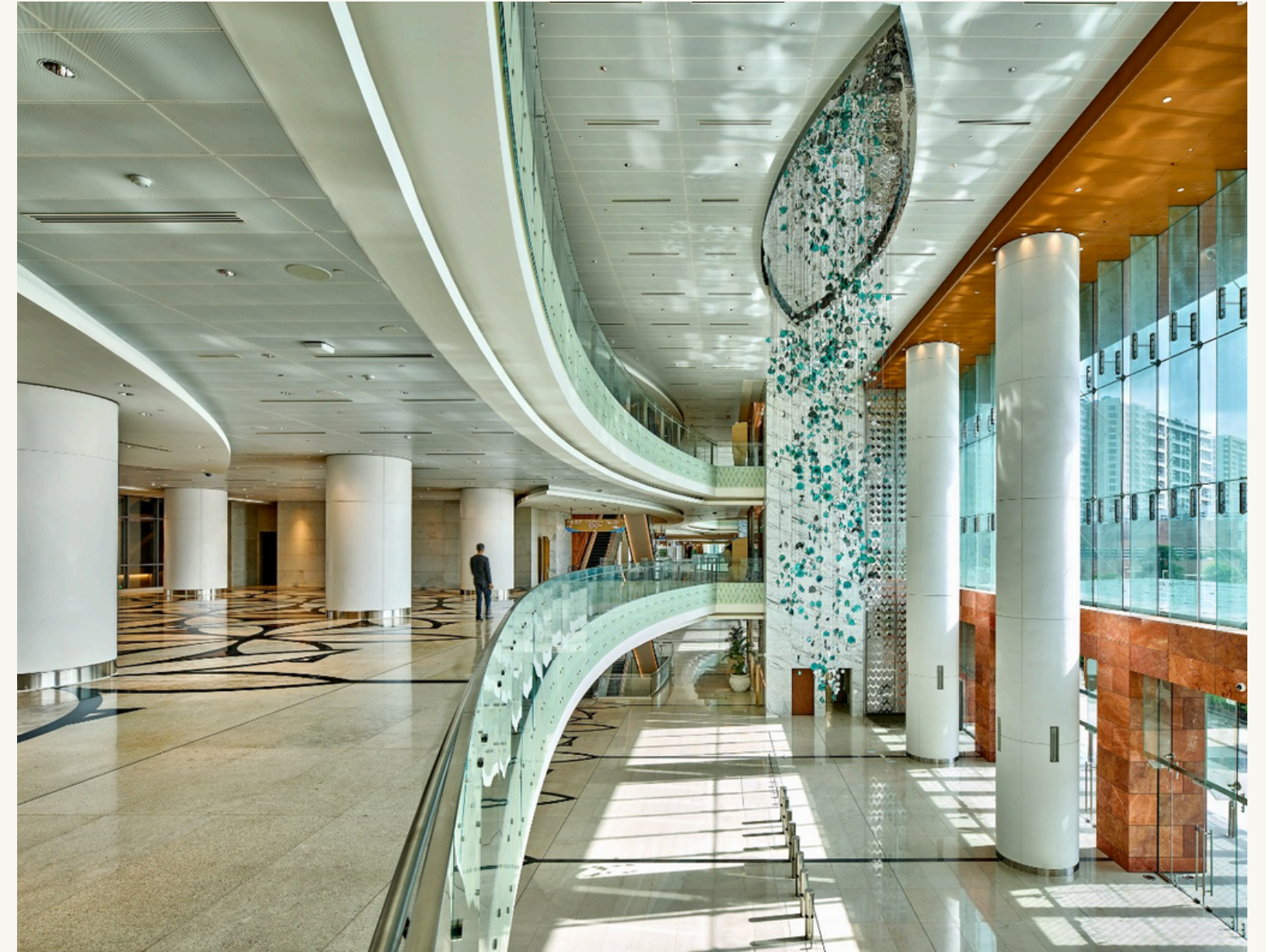
Global Adda- 19 March Jio World Convention Centre, Bandra- Kurla Complex (BKC)